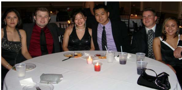
Beta Epsilon members and their dates from Rose Formal 2006