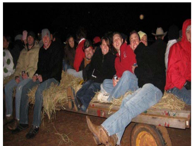
(Left) Brothers gather around the bonfire to keep warm