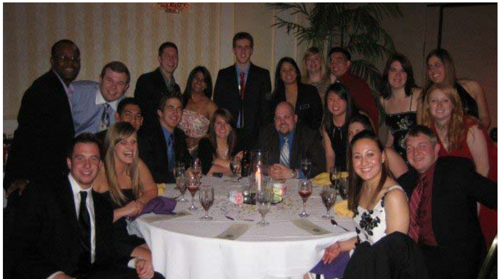
Members and pledges of Beta Epsilon pose for a group picture at LEAD